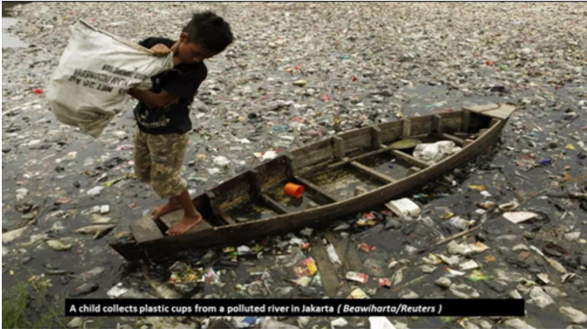
A child collects plastic cups from a polluted river in Jakarta